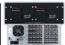
Mondo Matrix Cat5 Switch 16x16—256x256 221R3001