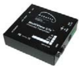
MultiView UTx Transmitter 400R3212