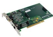
MultiView PCI Transmitter 4003246