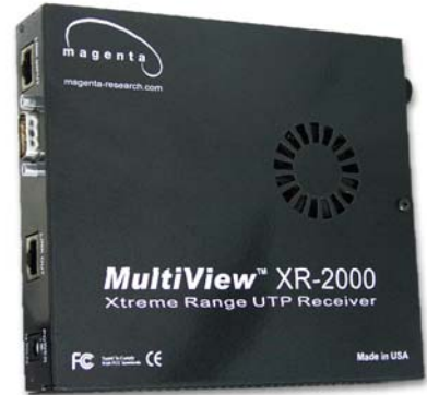
MultiView XR-2000DP-A Receiver 400R3681

Breakthrough MultiView XR-2000 Receiver widens Magenta's performance lead in video resolution and distance capabilities