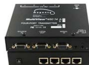
MultiView T4A Transmitter 400R2960