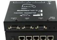
MultiView T5A Transmitter 400R3006